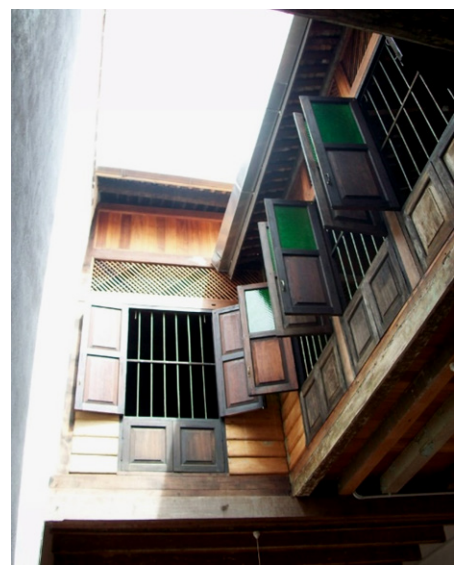
Figure 8: Traditional Courtyard of Shophouse (Air-well)

The opening provides natural ventilation (Figure 8), not only increasing the energy efficiency but contributing to an enjoyable private outdoor space for the residents (Rasdi, 2000). Courtyard (air well) also functioned to discharge the rain water from the roof to the sunken well. As water represents wealth in the Chinese belief (elaborate on this).