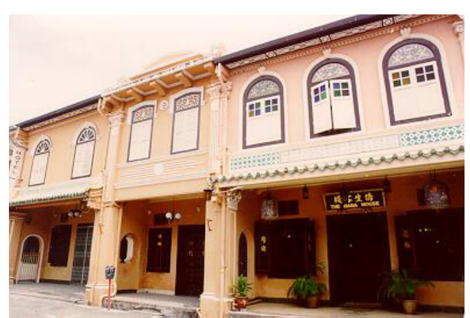
Figure 5: Façade of Baba Nyonya Shophouse Source: http://www.hbp.usm.my, (1994) Accessed on 10/07/2017

Ornamentation of the traditional courtyard shophouses, particularly on the street façade, is an important aspect of the buildings and for the architectural expression (Figure 5). However, this does not necessarily imply that a lack of ornamentation renders a building to a less significant architectural value. Simpler buildings rely on proportion, line and shape for their architectural appeal.