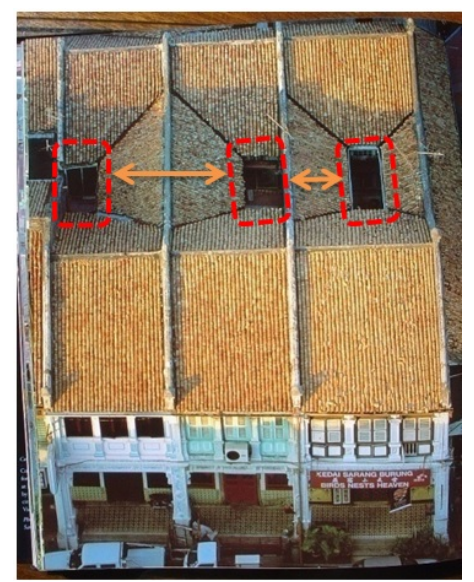
Figure7: Traditional Courtyard of Shophouse (Air-well)

middle part of the shophouses (Figure 7). It allows daylight to illuminate the internal space of the long narrow shophouses.