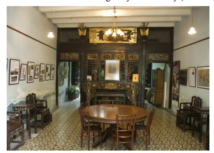
Figure 3: A hall after The Entrance Backlit by Courtyard

Fatland 2013 emphasized that cultural influences, whereby a traditional courtyard shophouse interior design welcoming space for visitors, which is not invited to go in beyond the screen is located along the sides of the room (Figure 3). This area will be furnished with a table, stools, heavy wooden chairs as well as side tables that are arranged symmetrically (Fatland, 2013).