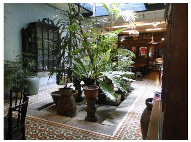
Figure 4: First Courtyard of Sun Yat Sen Museum.

by the courtyard that radiates through the two doorways as well as a carved wooden wall screen which separates the living hall for public from a more privacy area behind meant for family members. A bright place furnished with a set of table and chairs are reserved for guests to drink tea while having a conversation is located next to a rectangular courtyard.