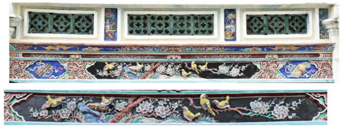
Figure 6: Parapet Wall Carvings

According to Kwok (2007), animal figure in Chinese culture brings different meaning. The plaster rendering such as a bouquet of flowers, fruits, mythical animal figures and geometrical shapes were used to decorate the pilasters placed in between the window openings which are the space above the arched transom and below the window openings. Most of the fruits and mythical animal figures are influenced by the ancient Chinese architecture, while the insertion of flowers, leaves and geometrical shapes are inspired by European and Malay architecture. (Figure 6).