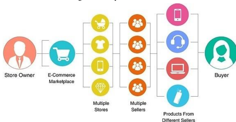
Figure 2: The basic structure of the marketplace.

Some generally accepted strategic principles, previously approved in the traditional enterprise management scheme, are becoming obsolete. Companies involved in various forms of collaboration on the basis of platforms consider the use of technical insights rather than marketing research and determination of competitive advantages based on the traditional MBA approach as the main development tools. In theory and practice of the global economy and management, the uberization model has a fundamentally different institutional format, the content, mechanisms, factors, and risks of which require a systematic study at the present stage. The content and organizational mechanism of the work of the uberization business model by the authors have already been described in detail in earlier studies (Gurina, 2019). In the framework of this article, the authors decided to touch on the technologies and tools that ensure its functioning. In particular, the fact that the uberization model is based on mediation in the form of a marketplace, but has some organizational features. Consider the basics of the functioning of marketplaces.