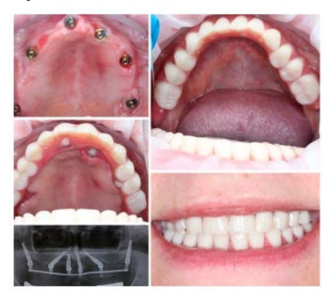
Figure 4: Orthodontic prosthesis installed on zygomatic and angular implants

Nevertheless, as mentioned above, this technique is practically not applicable in outpatient settings [28]. Such orthodontic treatment can only be performed in a hospital by a maxillofacial surgeon.