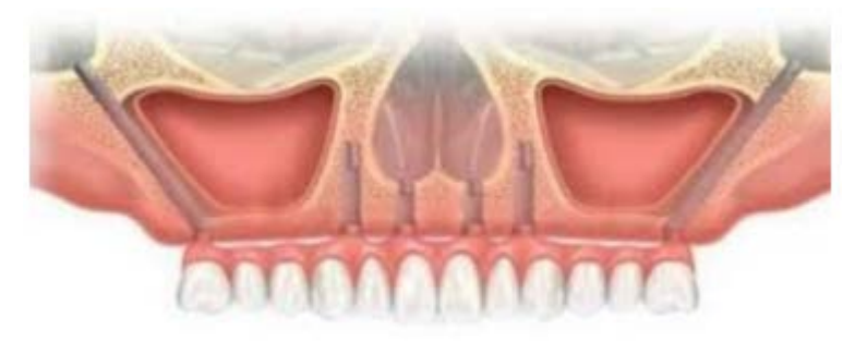
Figure 3: Options for implanting implants in the bone tissue of the upper jaw

Figure 3 schematically shows some options for implanting titanium rods into the zygomatic tissue and bone tissue of the upper jaw.